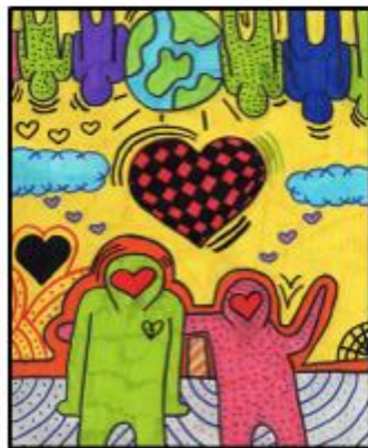
Listening with Understanding and Empathy